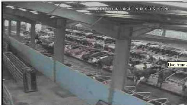
Live from Asda's

Cow cam shows the milking parlour at Barony College in Lockerbie which produces milk for our Scottish stores. It includes an automated milking machine which enables the cows to decide when they want to be milked and not the farmer!